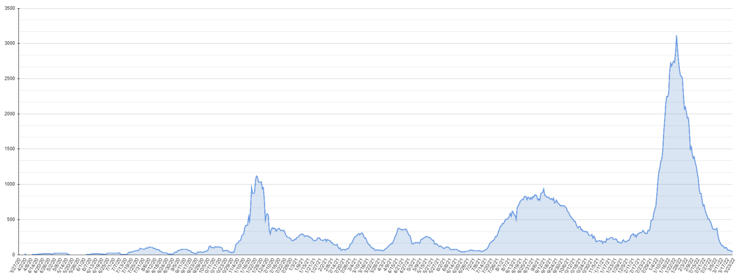
Pacific County COVID-19 Case Rate per 100,000 population over past 14 days (trend over time)