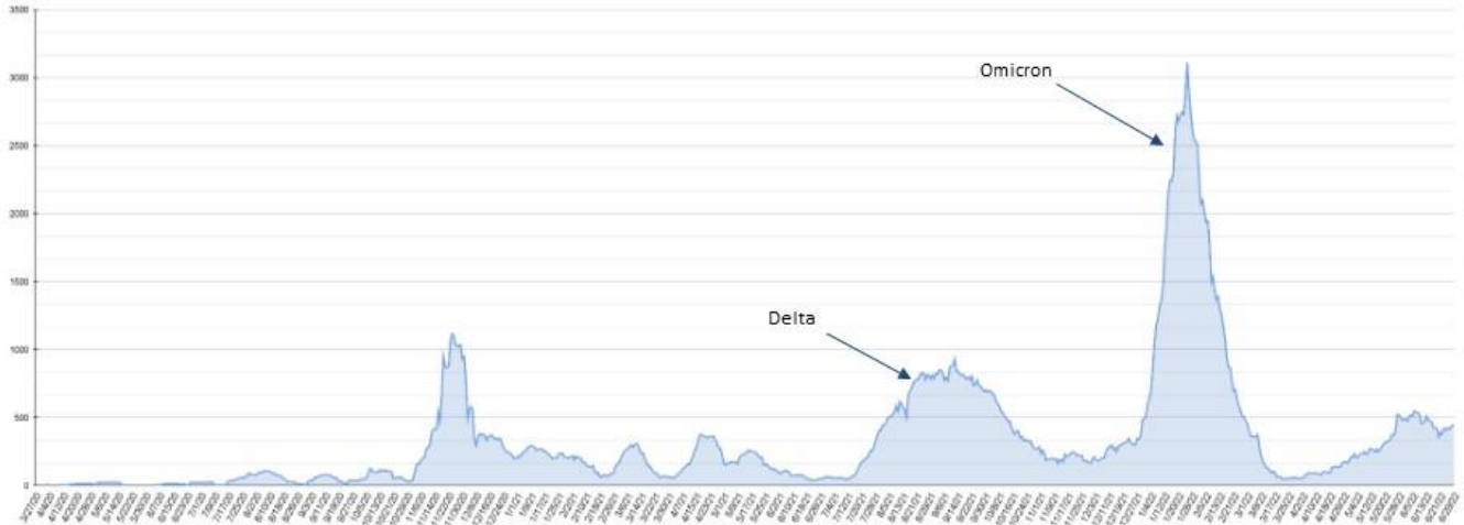
Pacific County COVID-19 Case Rate per 100,000 population over past 14 days (trend over time)