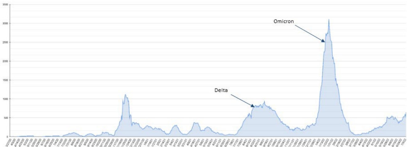
Pacific County COVID-19 Case Rate per 100,000 population over past 14 days (trend over time)