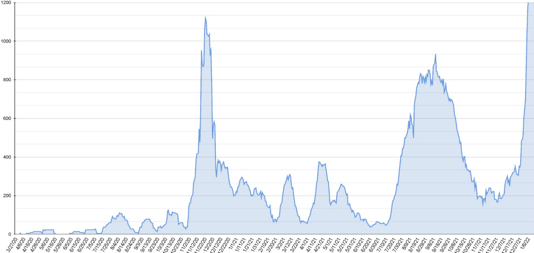
Pacific County COVID-19 Case Rate per 100,000 population over past 14 days (trend over time)